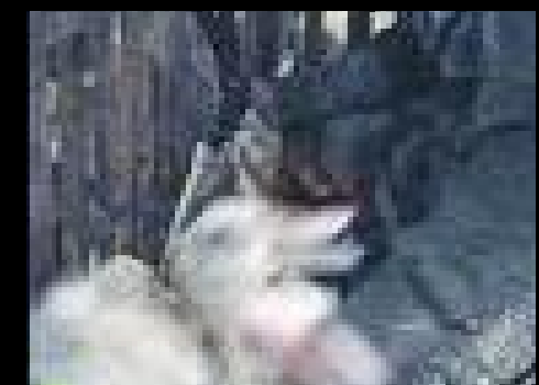
The worker throws the duck across the pen while grabbing another to repeat the procedure.