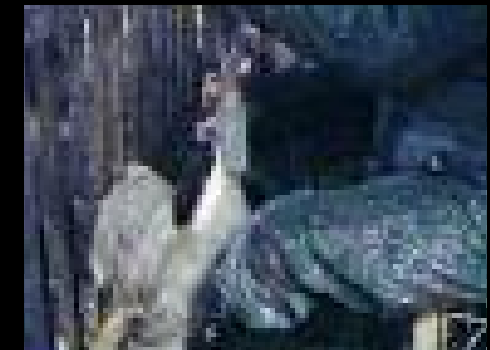
The long, metal pipe can be seen protruding through the duck's neck.