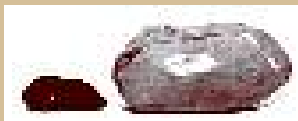
A liver from a healthy duck next to a liver from a duck who was force-fed to make foie gras.

Ducks live in vomit-covered pens or cages barely bigger than their own bodies for three weeks while they are force-fed.