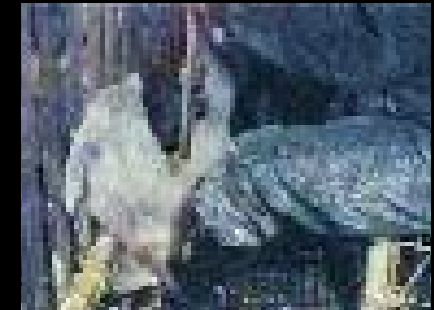
A worker clutches a duck, preparing to force the metal pipe down the bird's throat.