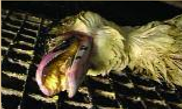
Force-feeding can lead to inhalation of regurgitated feed and a slow, painful death by suffocation.